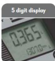
5 digit display