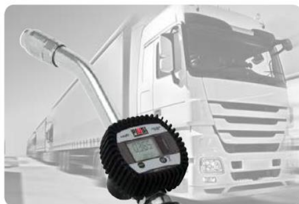
NOZZLE METER NEXT/2